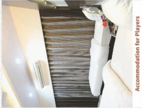
Accommodation for Players