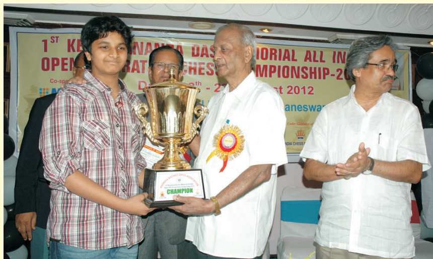
Champion - GM Santosh Vidit Gujrathi