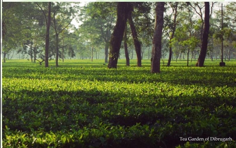
Tea Garden of Dibrugarh