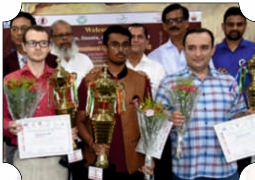
KIIT Open Odisha