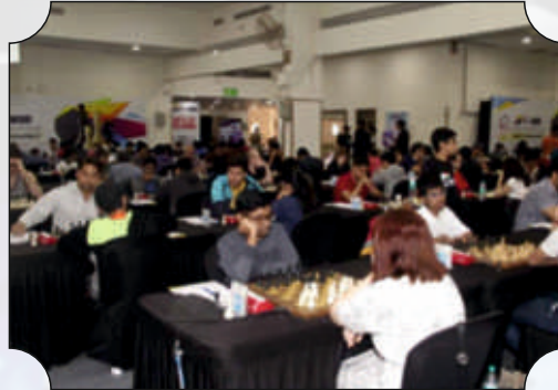
IIFL - Mumbai