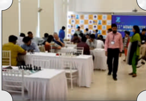
Mumbai Mayor's Cup