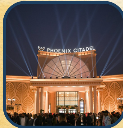
Phoenix Citadel Mall