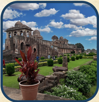
Mandu – Historical Tour