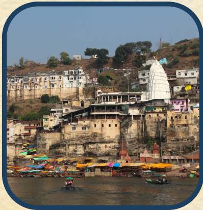
Maheshwar Ghats Take A Stroll