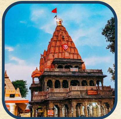
Mahakaleshwar Temple, Ujjain