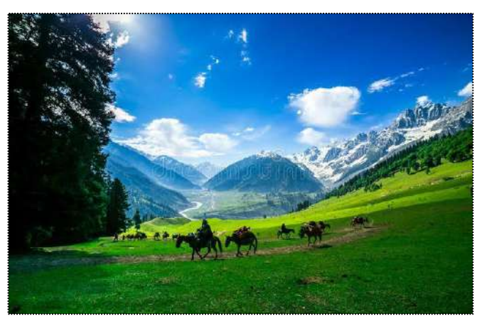
Pahalgam (90 KM)