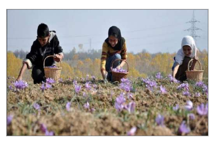
Saffron Land (10 KM)