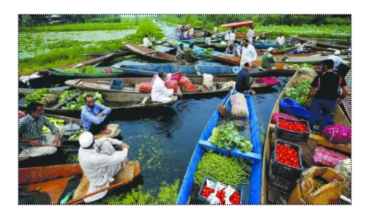
Dal Lake Floating Market (3 KM)

(Approx. Distance From Tournament Venue)