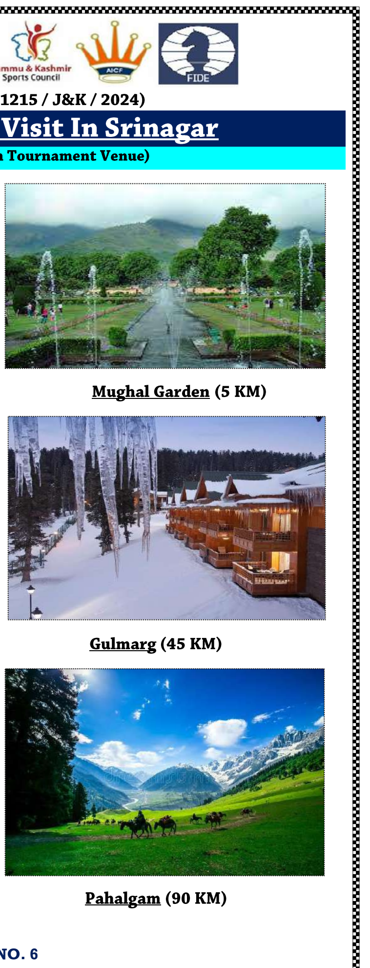
Gulmarg (45 KM)