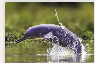
Dibru Saikhowa Dolphin Point