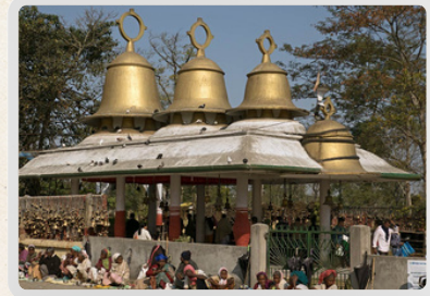
Bordubi Tilinga Mandir