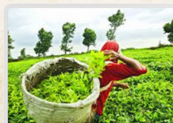
Assam Tea Garden