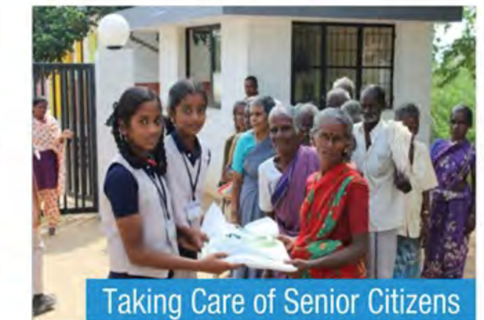
Taking Care of Senior Citizens