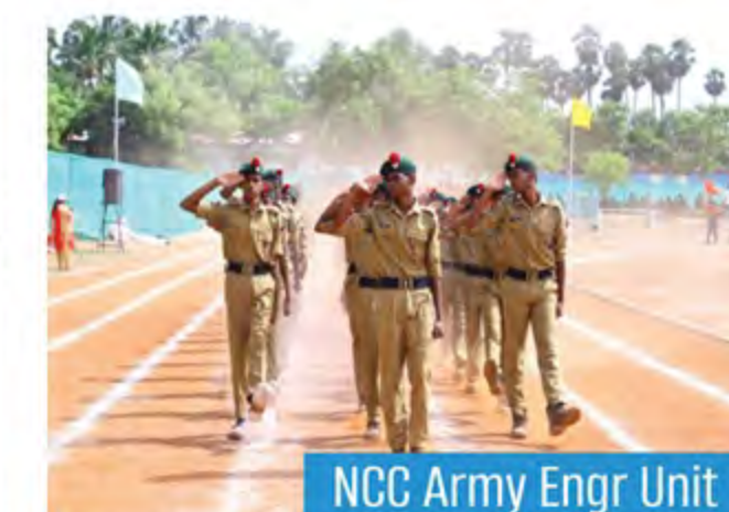
NCC Army Engr Unit