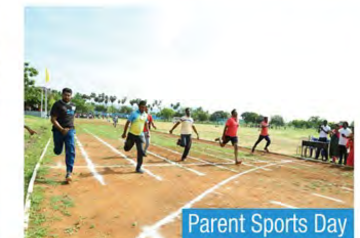
Parent Sports Day