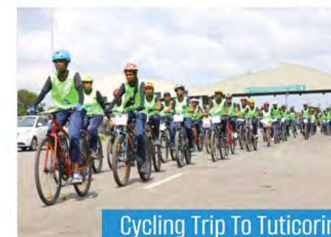
Cycling Trip To Tuticorin