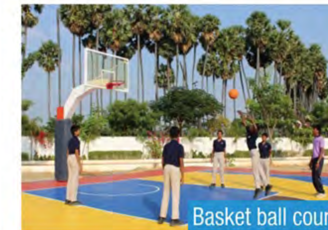
Basket ball court