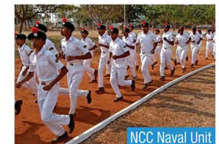
NCC Naval Unit