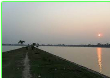
Geunkhali Tribeni sangam (27km)