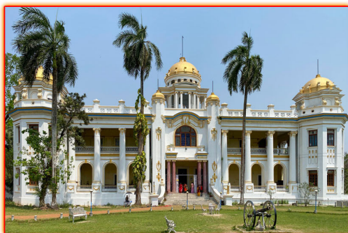
Mahisadal Rajbari (20km)