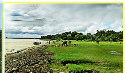
Tamluk Steamer Ghat (7km)