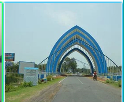
Digha Gate (102km)