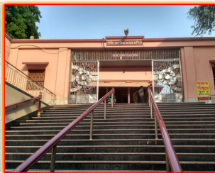
Tamluk Bargabhima Temple (5km)