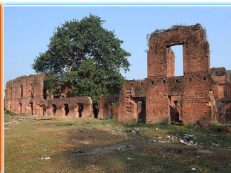
Tamluk Rajbari (6km)