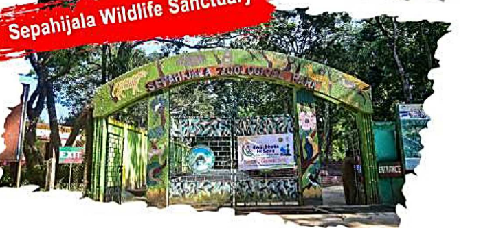
Sepahijala Wildlife Sanctuary