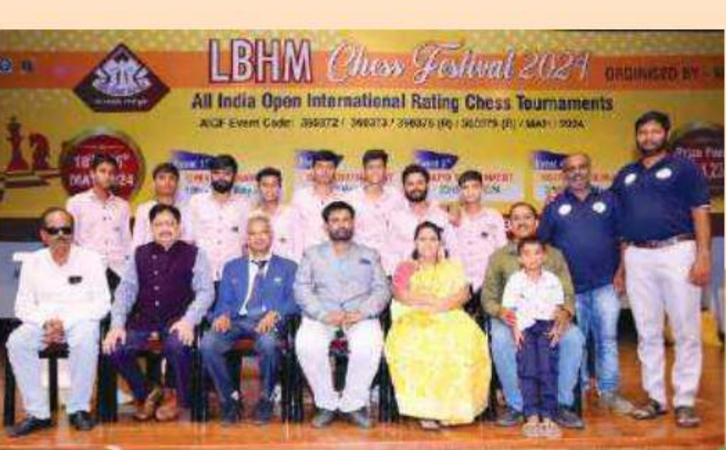
LBHM an Innovative Chess Movement!!