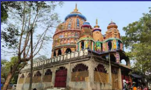
Maa Dewri Temple (65.0 km)

The Dassam Falls is a waterfall located near Taimara village in the Bundu subdivision of Ranchi district in the Indian state of Jharkhand. Dassam Falls is a natural cascade across the Kanchi River, a tributary of the Subarnarekha River. The water falls from a height of 44 metres (144 ft). The sound of water echoes all around the place. Dassam Falls at one of the edges of the Ranchi plateau is one of the many scarp falls in the region.