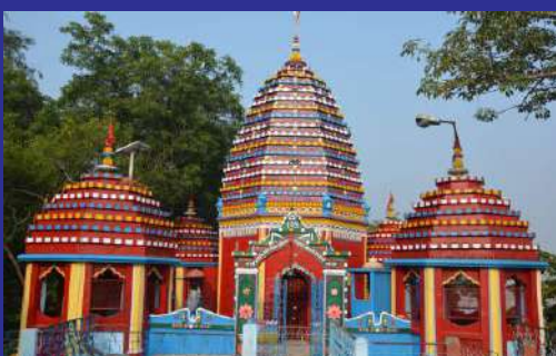
Maa Chinnamastika Temple (70.1 km)

Hundru Falls is a waterfall located in Ranchi District in the Indian state of Jharkhand. It is the 34th highest waterfall in India, and one of the most famous tourist places in the region. Hundru Falls are located on the course of the Subarnarekha River where it falls from a height of 98 metres (322 ft), creating one of the highest waterfalls in the state. The spectacular scene of the waterfalls has been described as "a sight to behold".