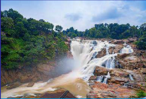
Dassam Falls (39.5 km)

The Dassam Falls is a waterfall located near Taimara village in the Bundu subdivision of Ranchi district in the Indian state of Jharkhand. Dassam Falls is a natural cascade across the Kanchi River, a tributary of the Subarnarekha River. The water falls from a height of 44 metres (144 ft). The sound of water echoes all around the place. Dassam Falls at one of the edges of the Ranchi plateau is one of the many scarp falls in the region.