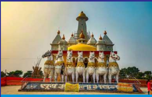
Surya Temple (38.7 km)

Maa Dewri Temple is an ancient temple, situated in Diuri village, Tamar near Ranchi in Jharkhand in India. The main attraction of the temple is, 700 year old murti of 16-armed village deity Maa Dewri . It is an ancient temple and was renovated few years back. The ancient temple was constructed by interlocking stones without using chalk or binding material. The temple was earlier known as Dewri Diri, meaning sacred stone of Diuri village.