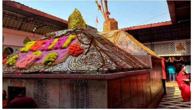
Maa Mangla Gauri Mandir