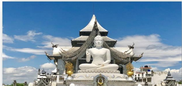
Metta Buddharam Temple