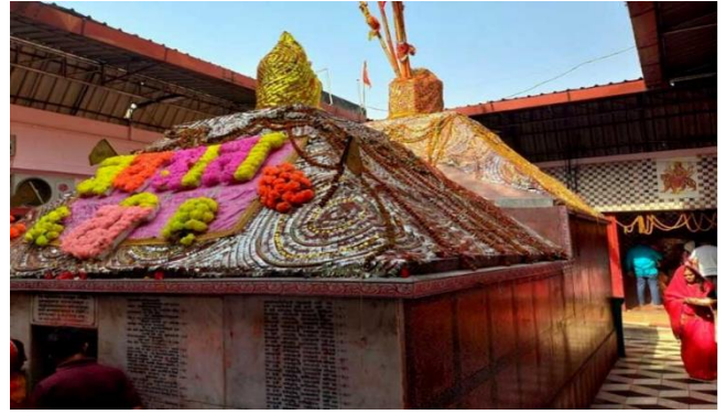
Maa Mangla Gauri Mandir