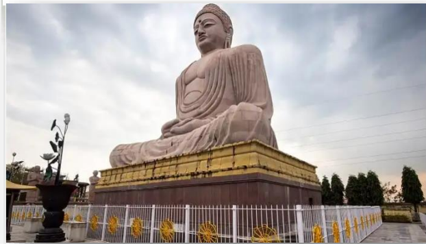
Great Buddha Statue