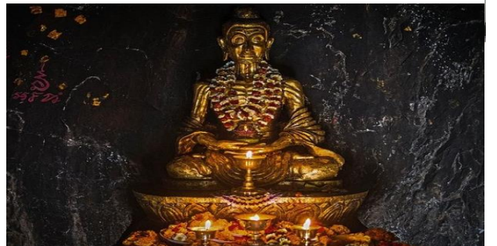
Dungeshwari Cave Temple