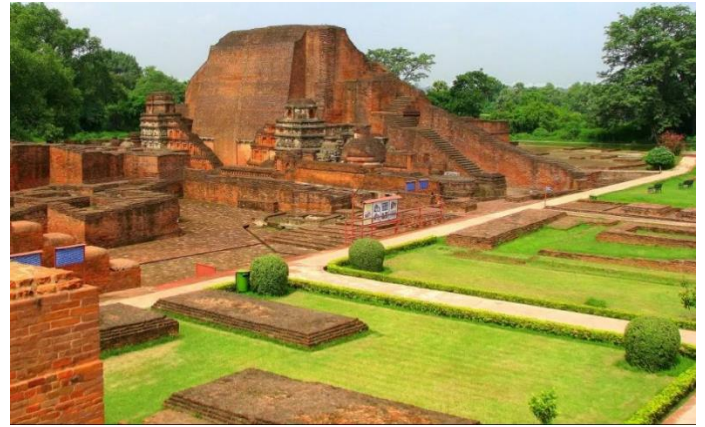
Nalanda University Ruins