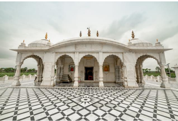
Jal Mandir - Pawapuri