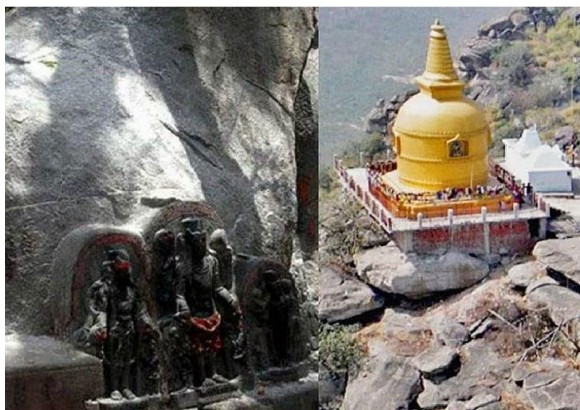
Pret Shila Mandir