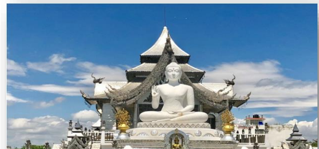
Metta Buddharam Temple