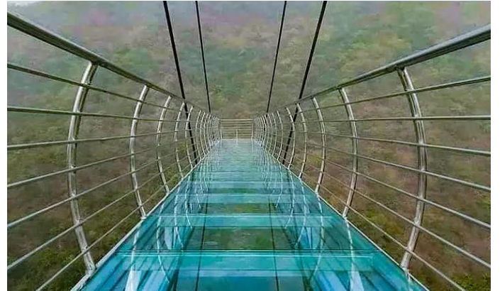
Sky Glass Bridge - Rajgir