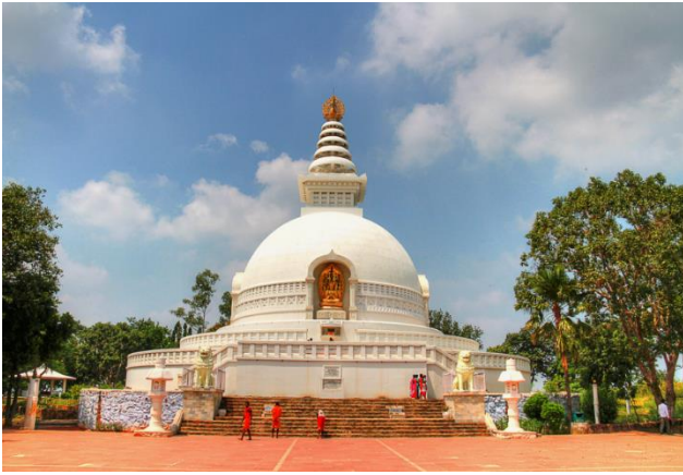
Vishwa Shanti Stup- Rajgir