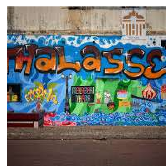
GRAFFITI ROAD THALASSERY