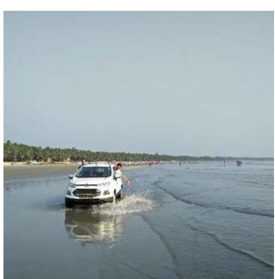
MUZHAPPILANGAD DRIVE IN BEACH