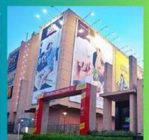
LULU SHOPPING MALL