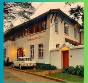
MATTANCHERI & FORT KOCHI