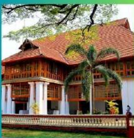
BOLGHATTY & VYPEEN ISLANDS