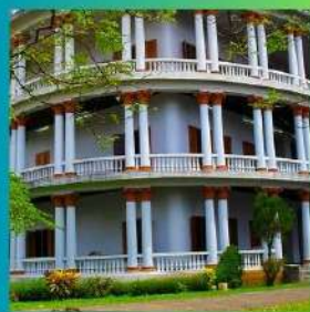
HILL PALACE MUSEUM