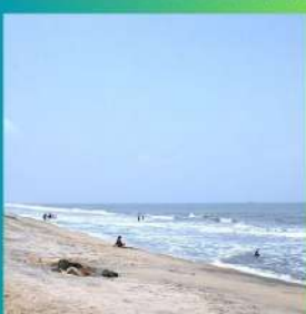
ANDHAKARANAZHI & CHERAI BEACH