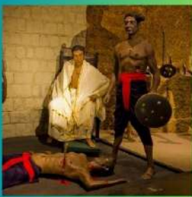
MUSEUM OF KERALA HISTORY, EDAPPALLY