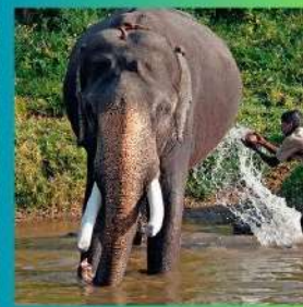
ELEPHANT TRAINING CENTRE, KODANAND