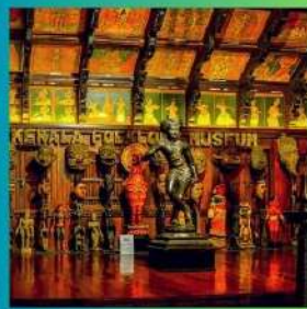
KERALA FOLKLORE MUSEUM