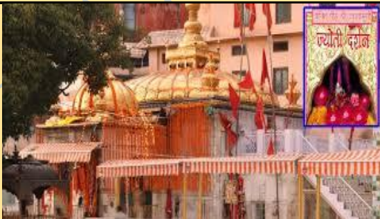
Jwala Ji, 35 Km

The Dhauladhar mountain range is located in the Indian state of Himachal Pradesh, in the Lesser Himalayas. It stretches across districts like Kangra and Chamba, forming a prominent backdrop for popular towns such as Dharamshala, McLeod Ganj, and Palampur.