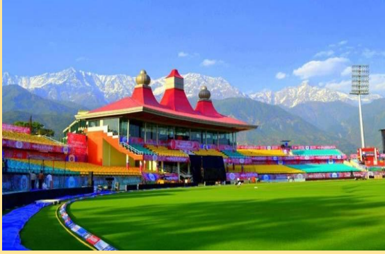
International Cricket Stadium ,17Km

Himachal Pradesh Cricket Association Stadium is an international cricket stadium in Dharamshala hill station of Himachal Pradesh, India.