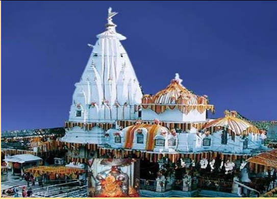
BRIJESHWARI TEMPLE 3 Km

The Vajreshwari Devi Temple , also known as Brajeshwari Devi Temple , Bajreshwari Mata Temple , or Kangra Devi Temple , is a prominent Hindu temple in Kangra district , Himachal Pradesh. Distance from the venue of about 2 KM.