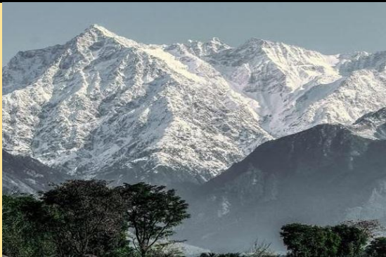
Dhauladhar Range, 20 Km

A Hindu temple dedicated to Shri Chamunda Devi , a form of Goddess Durga, located at 19 km away from Palampur town in Dharamshala Tehsil of Kangra district.