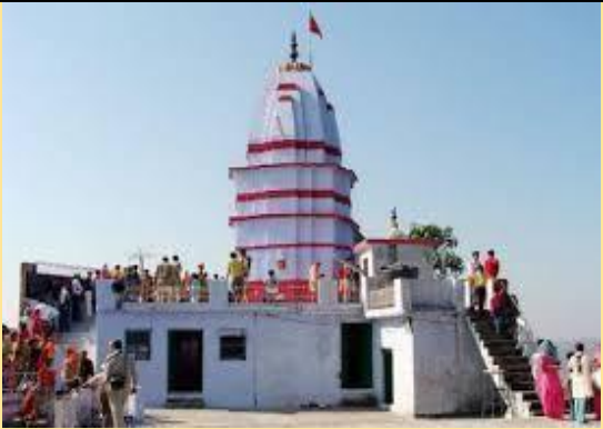
JAYANTI MATA TEMPLE, 7Km

The Vajreshwari Devi Temple , also known as Brajeshwari Devi Temple , Bajreshwari Mata Temple , or Kangra Devi Temple , is a prominent Hindu temple in Kangra district , Himachal Pradesh. Distance from the venue of about 2 KM.