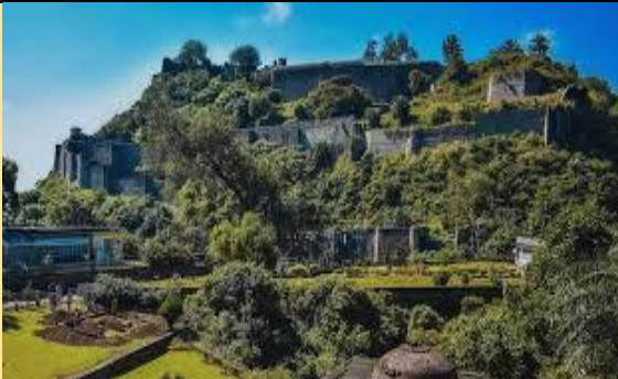
Kangra Fort, 5 Km

The Jayanti Mata Temple in Kangra is a Shakti Peeth dedicated to Goddess Durga, known for its significance in Hindu mythology and its historical connection to the Pandavas. Although often associated with Kangra, the main temple is located in Punjab's Jayanti Majri village, while the Kangra region has its own famous The Jayanti Mata Temple is believed to be a wish-fulfilling goddess and a kuldevi for the Pandavas