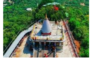
MAA SHARDA TEMPLE- MAIHAR