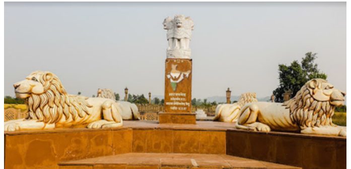
CENTRE POINT OF INDIA KARAUNDI