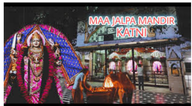
MAA JALPA DEVI MANDIR