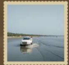
MUZHAPPILANGAD DRIVE IN BEACH