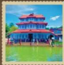
PARASSINIKADAVU MUTHAPPAN TEMPLE